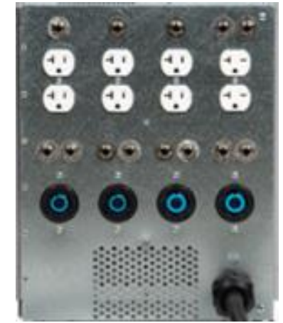
Plug user equipment into power outlets on unit back panel