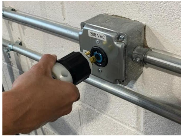
Plug unit into power outlet